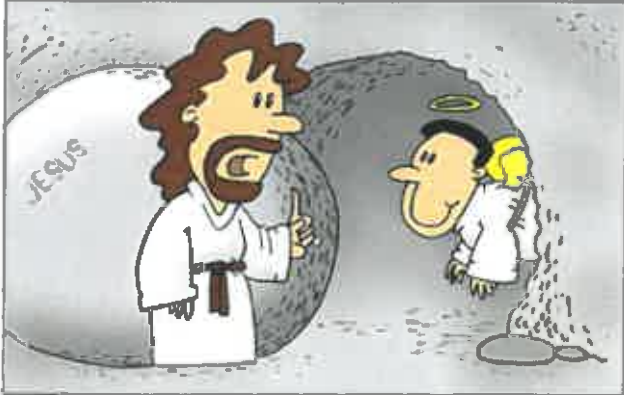
(See John 20 | 18) 03 29 2022

Lenten Suppers (March 2 nd , 9 th , & 16 th ) 6:00 PM Palm Sunday, March 20 th 10:30 AM Maundy Thursday, March 24 th 7:00 PM Good Friday, March 25 th 7:00 PM Easter Vigil, March 26 th 7:00 PM Easter Sunday Resurrection, March 27 th 10:30 AM