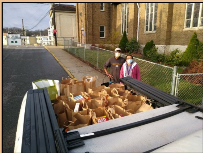
Volunteers with the Good Shepherd food bank in McKees Rocks, Pa. are pictured with the truckload of generosity which was donated by members of Ascension Church.

Thank you to everyone who donated to this year's Thanksgiving food drive in support of the Good Shepherd food bank!