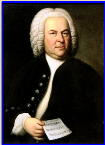
Bach in 1746 by Elias Gottlob Haussmann