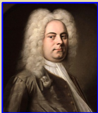
Portrait of Handel by Balthasar Denner c. 1726