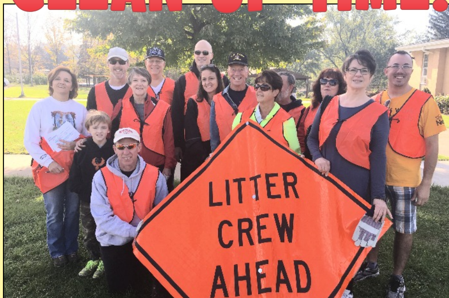
Ascension's 2017 Clean-Up Crew got the job done with a smile.